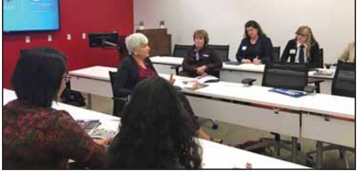
Smith and Holyoke Information Session