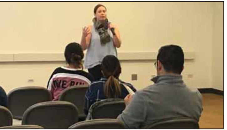
Amherst Information Session