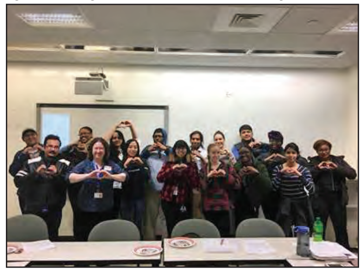
Fall 2017 Session 1

We host the Transfer Leadership Class (TLC) two times per semester! It is designed to help students transfer all over the United States and Illinois to the top schools in the nation and to get funding! Here are photos of our graduates.