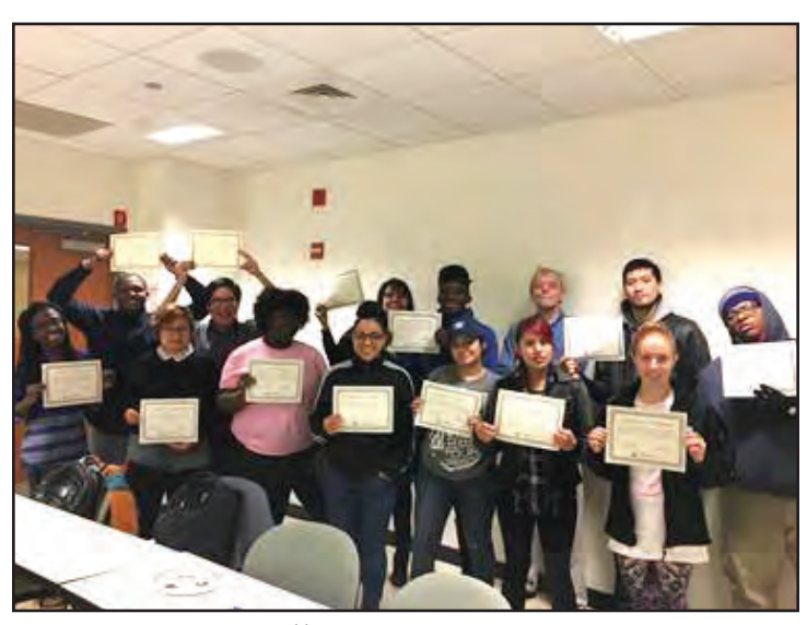
Fall 2017 Session 2