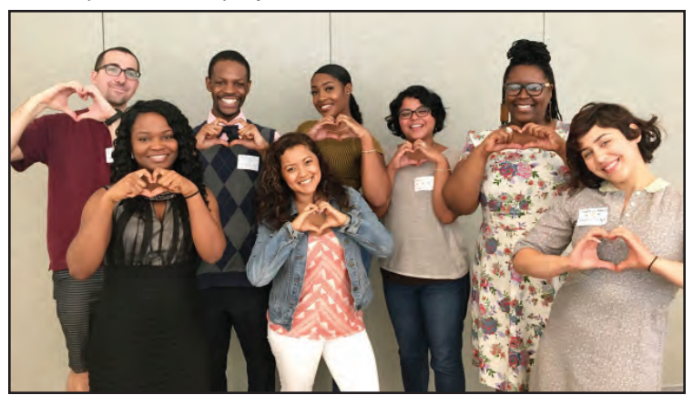
All of these rockstars transferred out-of state to the top schools in the nation! YAY!