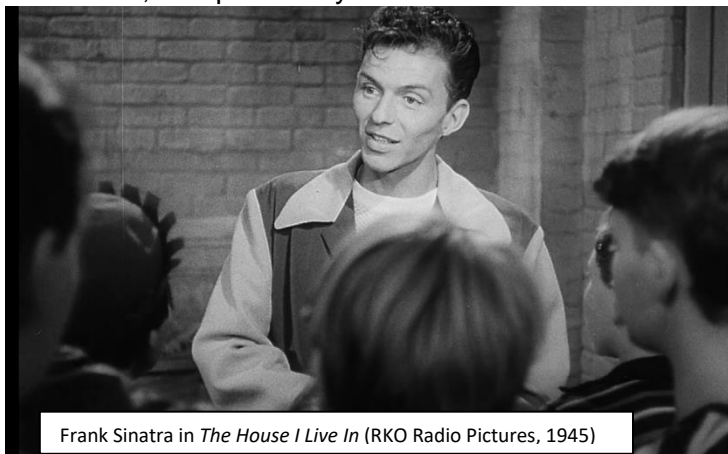
Frank Sinatra in The House I Live In (RKO Radio Pictures, 1945)

The Library of Congress announced a few weeks ago that it has hundreds of hours of digitized motion pictures that will be freely available on the newly launched National Screening Room ( https://www.loc.gov/collections/national-screening-room/ ) website. They are historical documents which reflect the. These short films are historical documents, which reflect attitudes, perspectives, and beliefs of the time, and place they were recorded. The collection includes 298 items with new items added